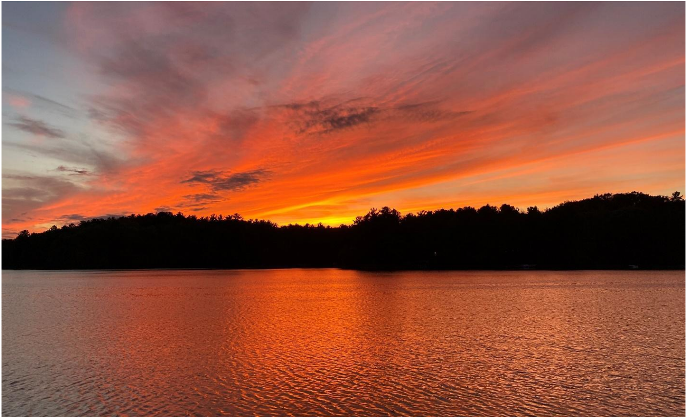
Sunset Over Lake 5, September 3, 2022

For additional information regarding the lake level, please feel free to contact Brandon Falenski by email at bfalenski@yahoo.com